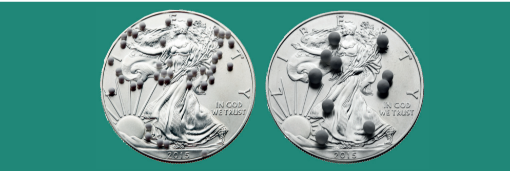
Figure 1 Accu Spheres with a target median diameter of 1.6 mm and 3.2 mm

UniSpheres are available in a range of sizes, from 1.6 mm to 8 mm. A unique forming mechanism is used to produce highly mono-sized particles, but when size