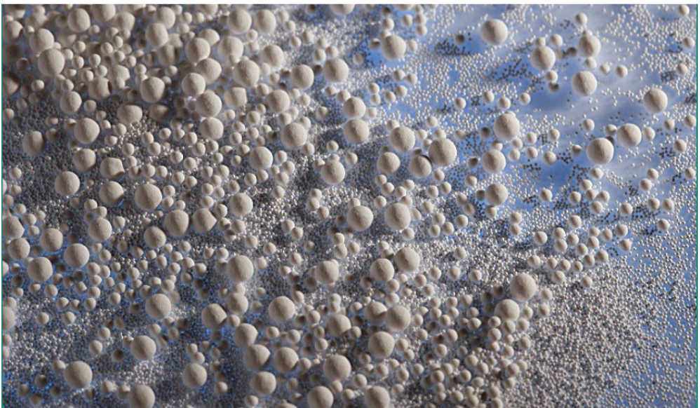
Figure 4 Accu Sphere catalyst carriers are available in a multitude of uniform sizes